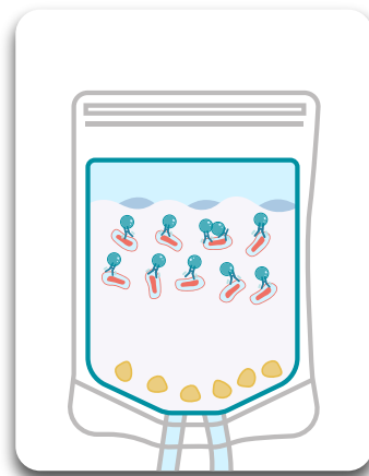
3 Separate Cells