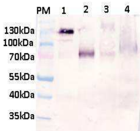
A typical western blot with biotinylated B-A55 mAb :